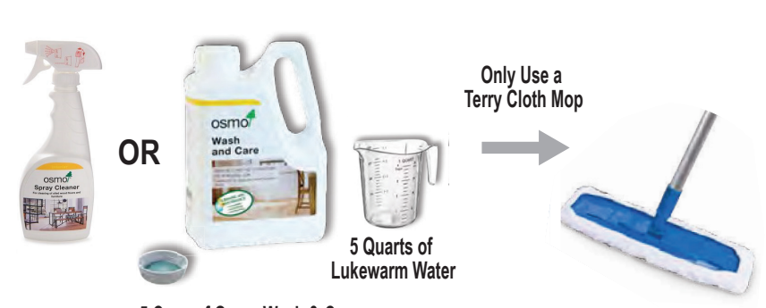
5 Caps of Osmo Wash & Care

Mix 5 caps of Osmo Wash and Care with 5 quarts of lukewarm water in a bucket. Mop the entire floor with this mixture using a Terry Cloth mop. Follow the grain when mopping. For a higher degree of cleaning, the dosage can be increased to a mixing ratio of 10 caps to 5 quarts of water. Mop with a slightly damp cloth. *IMPORTANT* Make sure to avoid any excessive water.